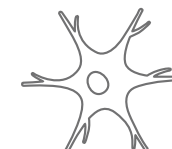
Central Nervous System