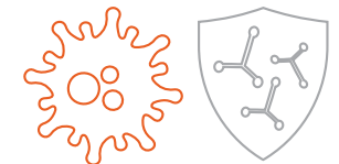
Autoimmune Diseases and Immuno-oncology

Through our scientists' research efforts, we're opening the door to brand-new discoveries that could revolutionize healthcare!